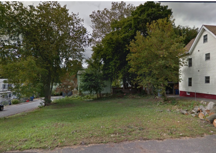
Lot (South view)