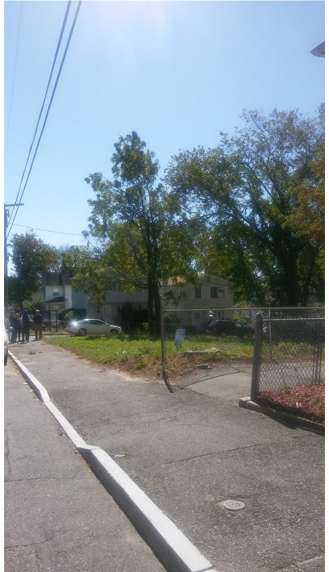
Lot (West view)