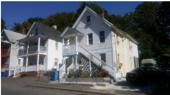
Neighboring homes (North view)