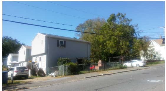
Neighboring homes (East view)