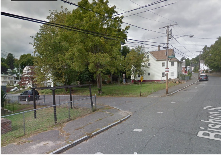
Lot (East view)